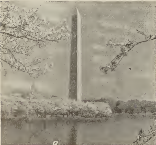
Japanese Flowering Cherry

Price: Mail Order Size, 55c each, $6.00 per doz.; 2 yr., No. 1, 75c each, $7.50 per doz., $60.00 per 100.